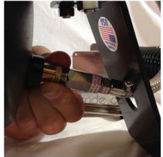
Now, plug your compressor into the side port on the air tank. Simply, through our EZ Tank Bracket hole.