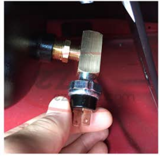
Next, thread the pressure switch into the tee. We suggest the backside Leaving the front for you Spare Air™.