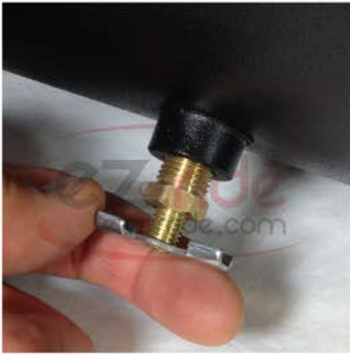
The Drain Cock will thread into the bottom tank port. This is used to drain any moisture.