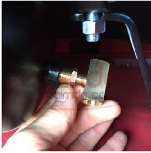
Thread the Tee into the side of the air tank.