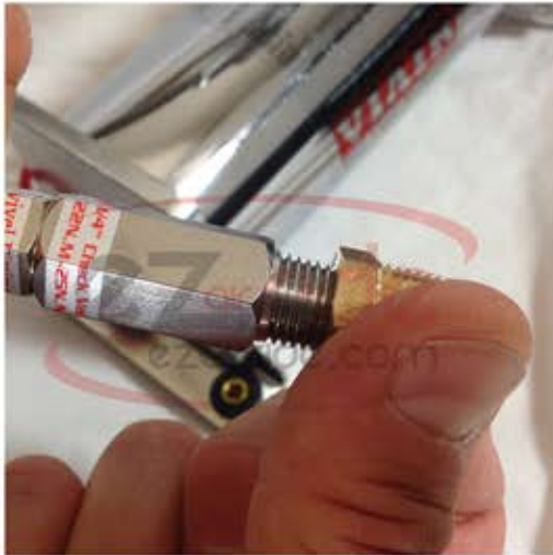
Thread the last 1/4" reducer to the Viarr 444c Chrome Compressor.